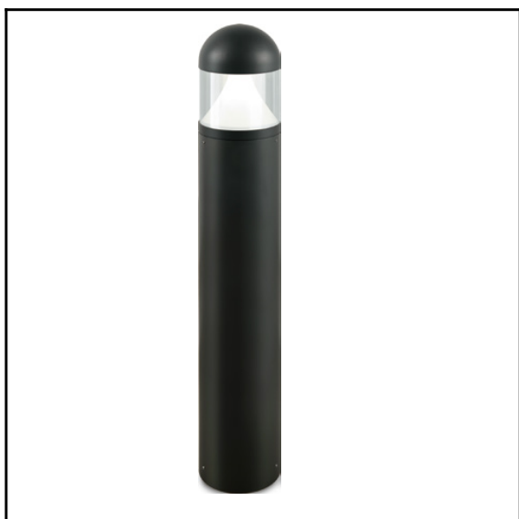
The photograph may not match the reference exactly. Please read the product description to identify the finish.