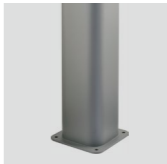
C-162S-A With Flange Version.